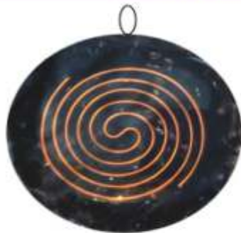
FREQUENCY EMBEDDED PROTECTION PENDANT

ONCE IN A WEEK, PLACE THE PENDANT ON THE GROUND FOR 5 MINUTES, FOR GROUNDING OF THE ABSORBED ENERGIES IF ANY.